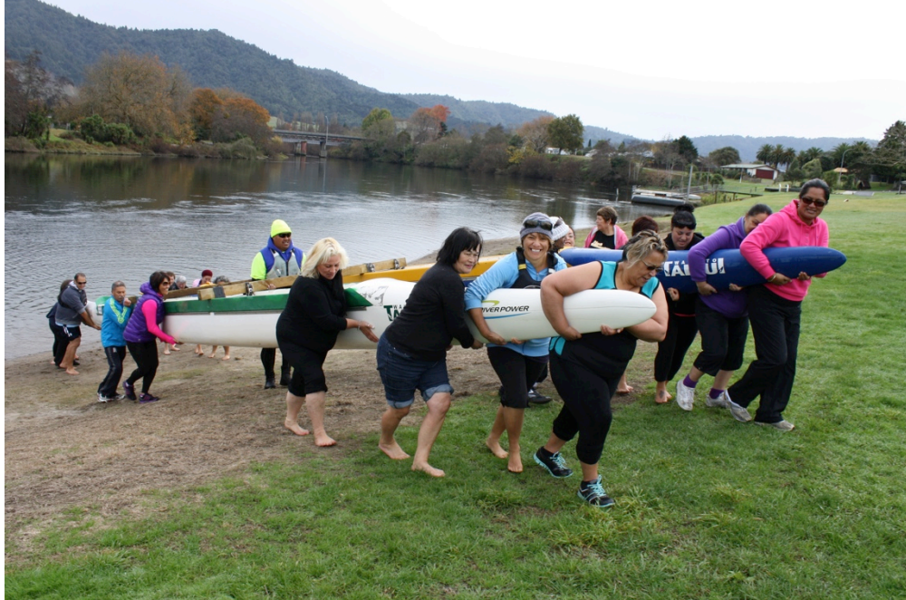
Figure 2: Team building on Te Awa o Waikato (Cohort 8)